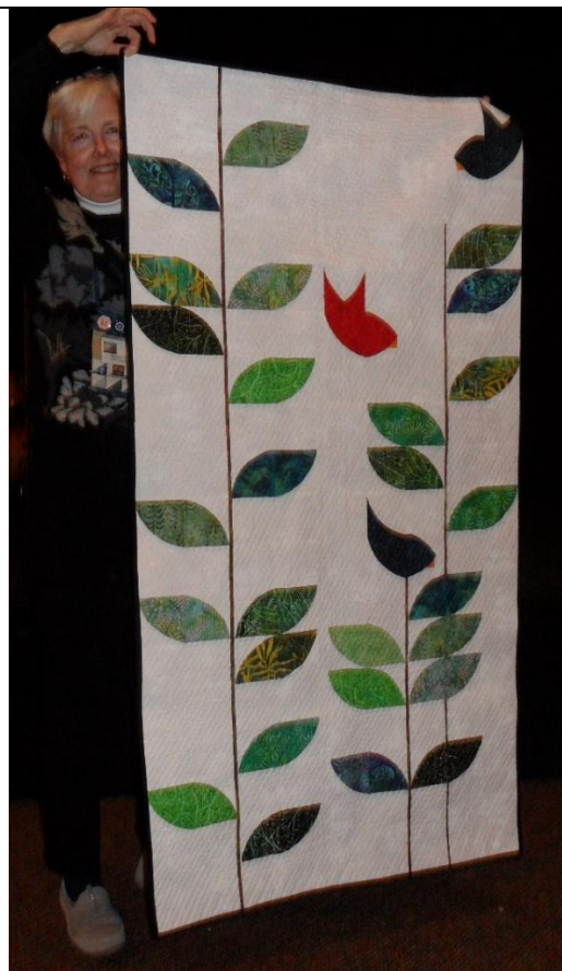
Susan B. - Bird Song using the Mini Quick Curve Ruler.