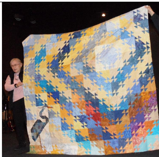
Hilke H., above, showing the quilt top for our 2025 raffle that is ready to be quilted.