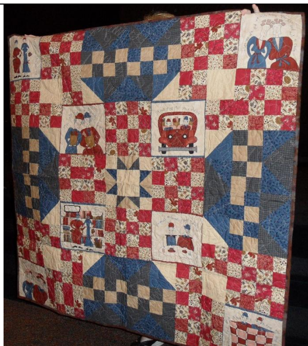
Betty T. with a kit about quilting.